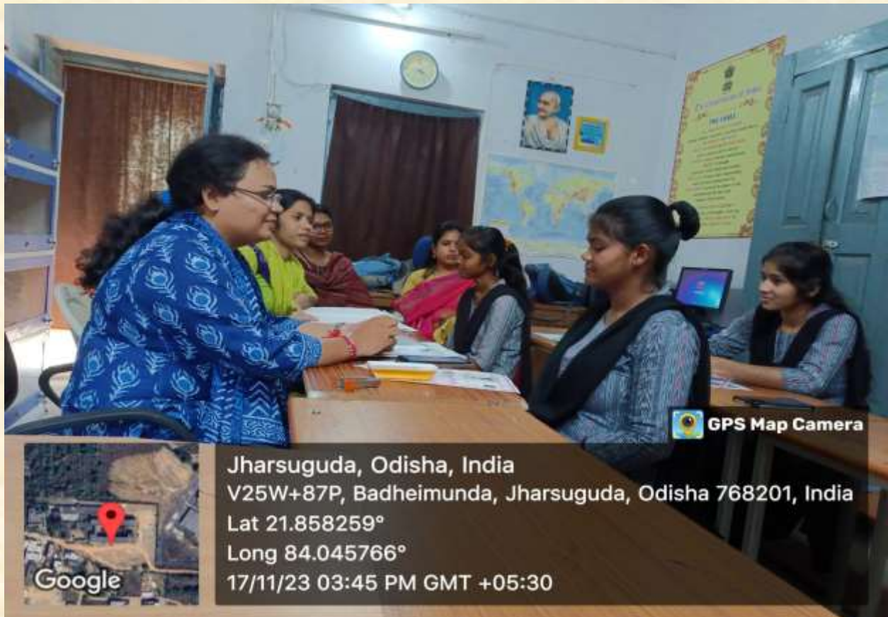
Interaction with the students in the Department