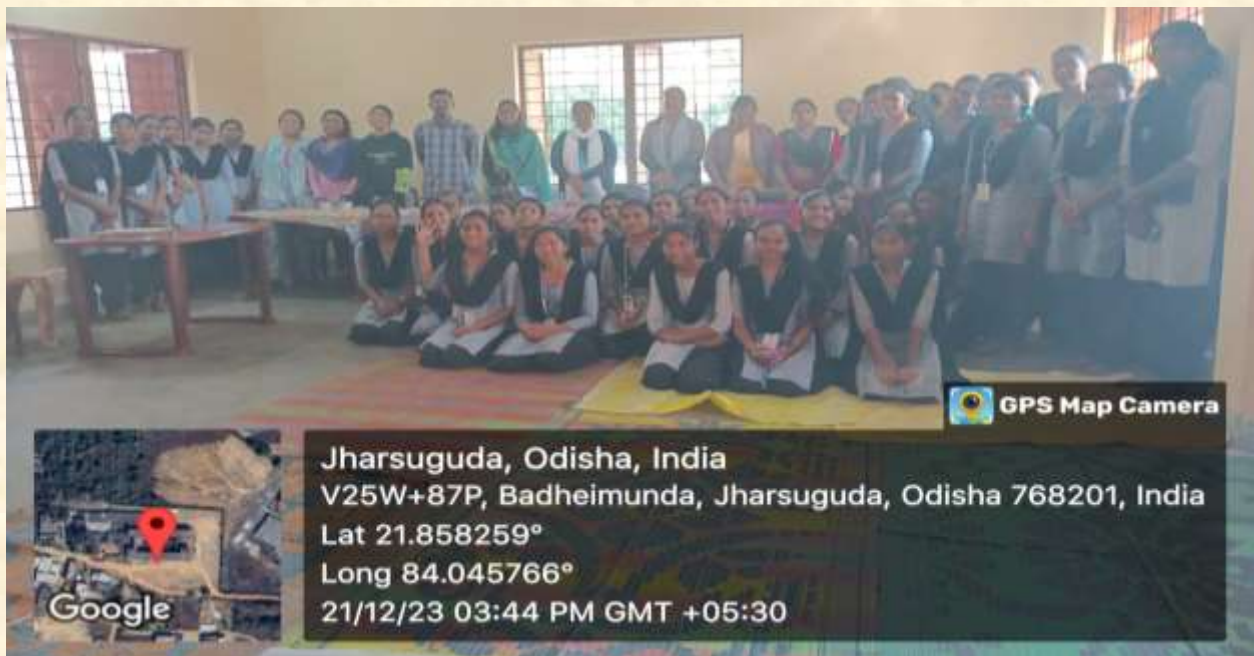
Visit of the Committee and Squad Members to the Girls' Hostel