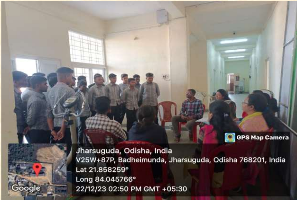
Visit of the Committee and Squad Members to the Boys' Hostel

Jharsuguda, Odisha, India V25W+87P, Badheimunda, Jharsuguda, Odisha 768201, India Lat 21.858259° Long 84.045766° 22/12/23 02:59 PM GMT +05:30