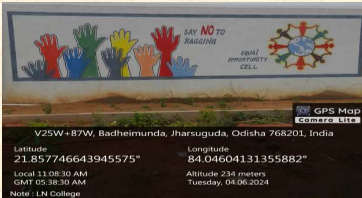
Painting on the Boundary Wall of the College