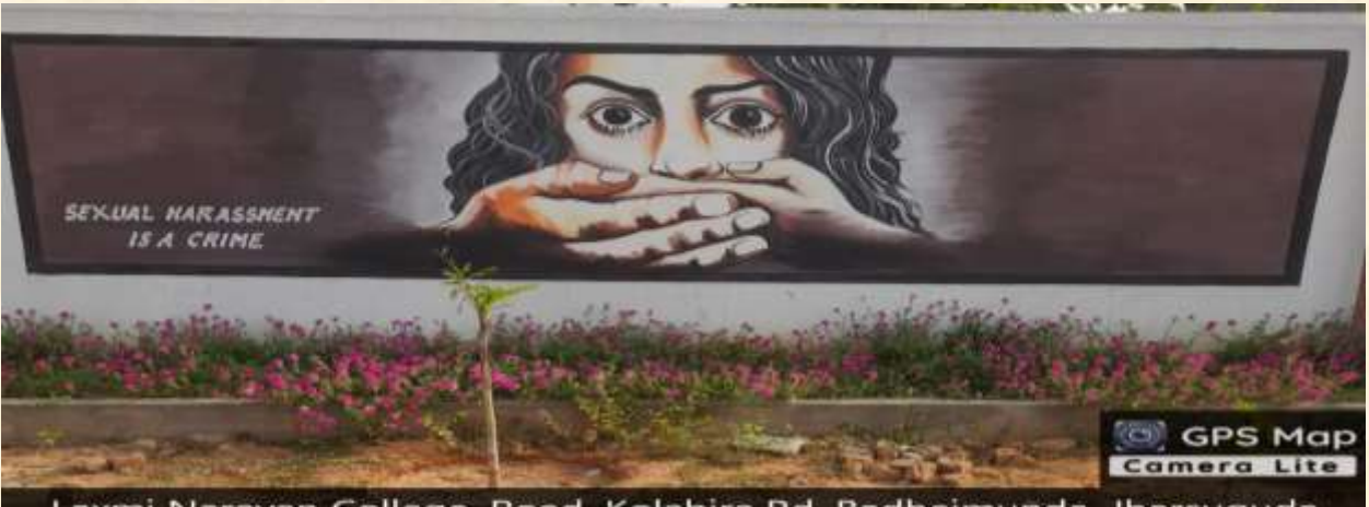
Laxmi Narayan College, Road, Kolabira Rd, Badheimunda, Jharsuguda, Odisha 768201, India