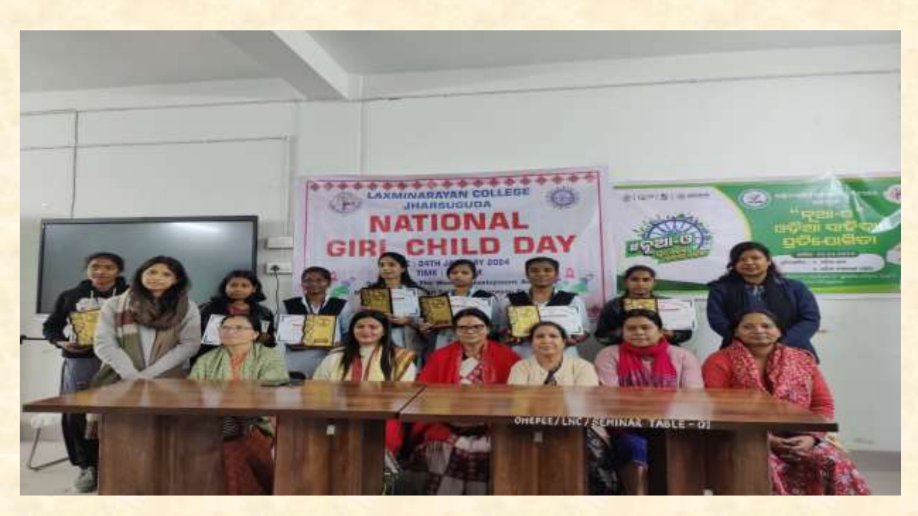
FELICITATION OF FEMALE CHAMPIONS (IN ACADEMICS, SPORTS, SOCIAL SERVICE, NCC & CULTURAL) ON THE OCCSION OF THE OBSERVATION OF NATIONAL GIRL CHILD DAY 2024