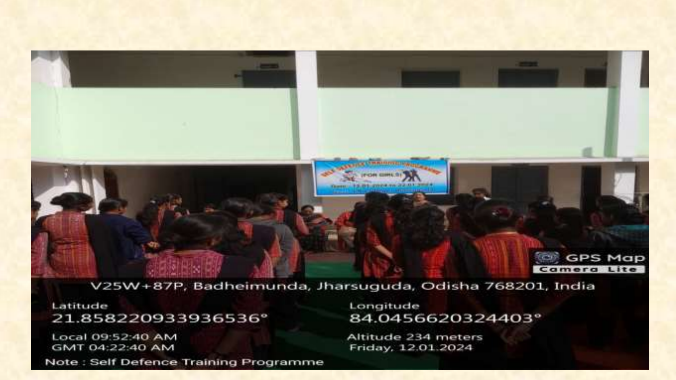
SELF-DEFENCE TRAINING PROGRAMME FOR GIRLS TO FIGHT THEIR OWN BATTLE