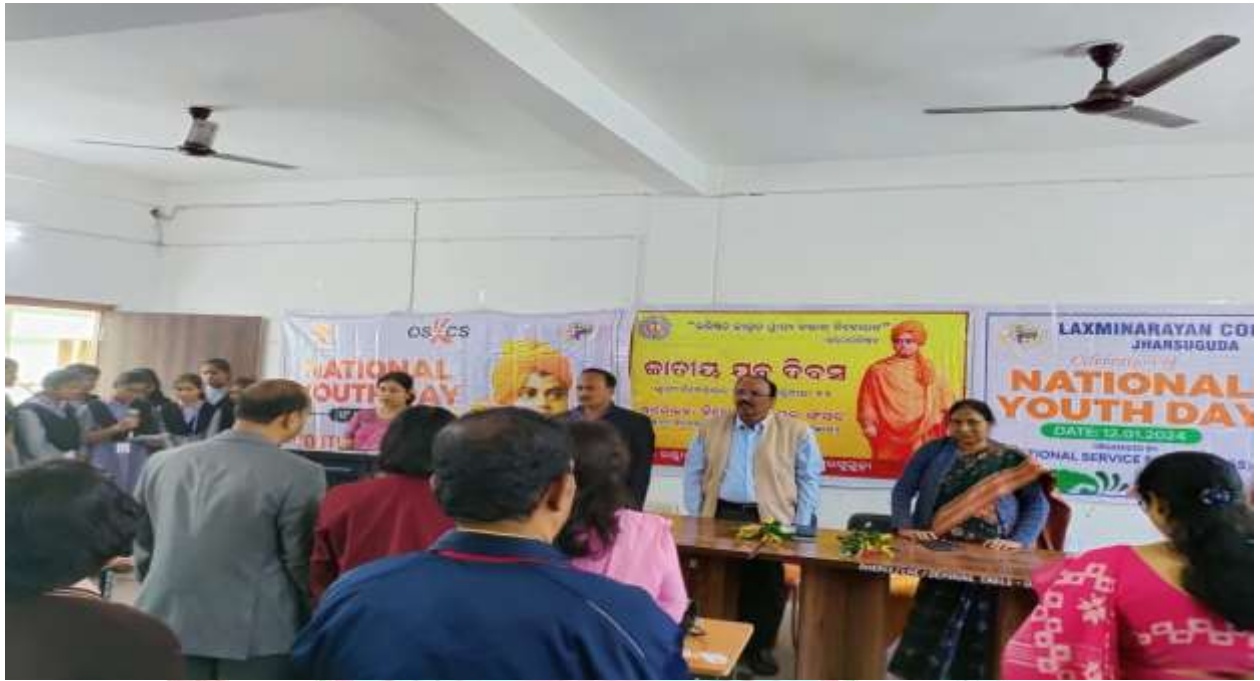
CELEBRATION OF NATIONAL YOUTH DAY