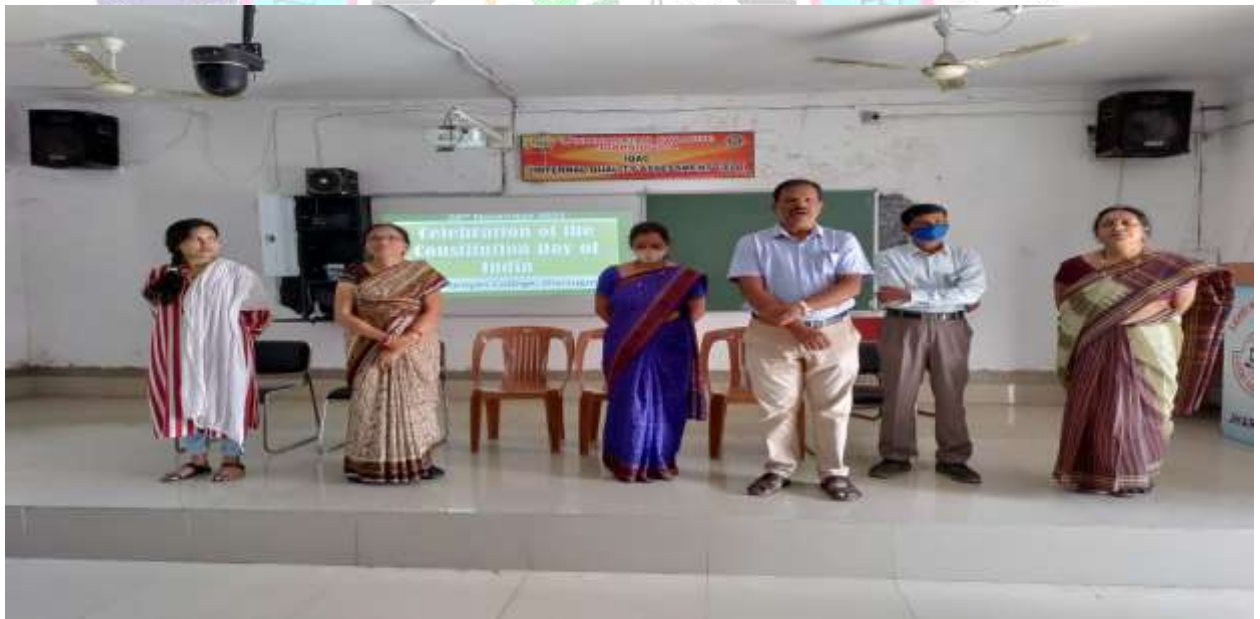
CELEBRATION OF CONSTITUTION DAY