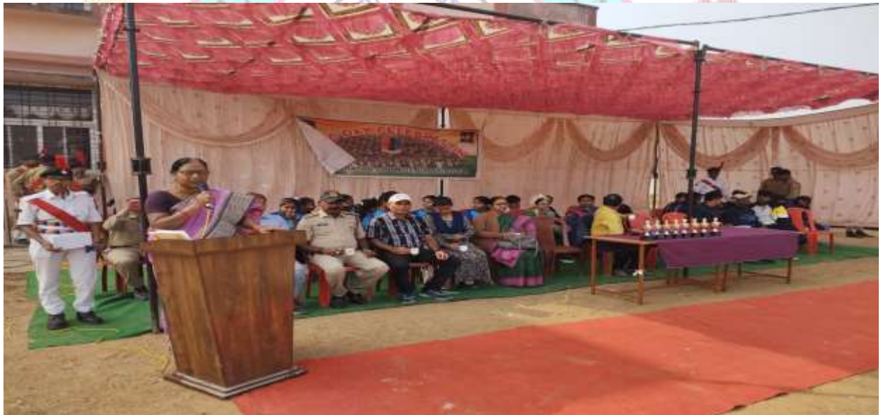
CELEBRATION OF NCC DAY