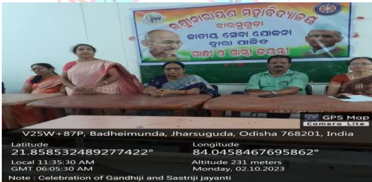
CELEBRATION OF GANGHIJI AND SHASTRIJI JAYANTI