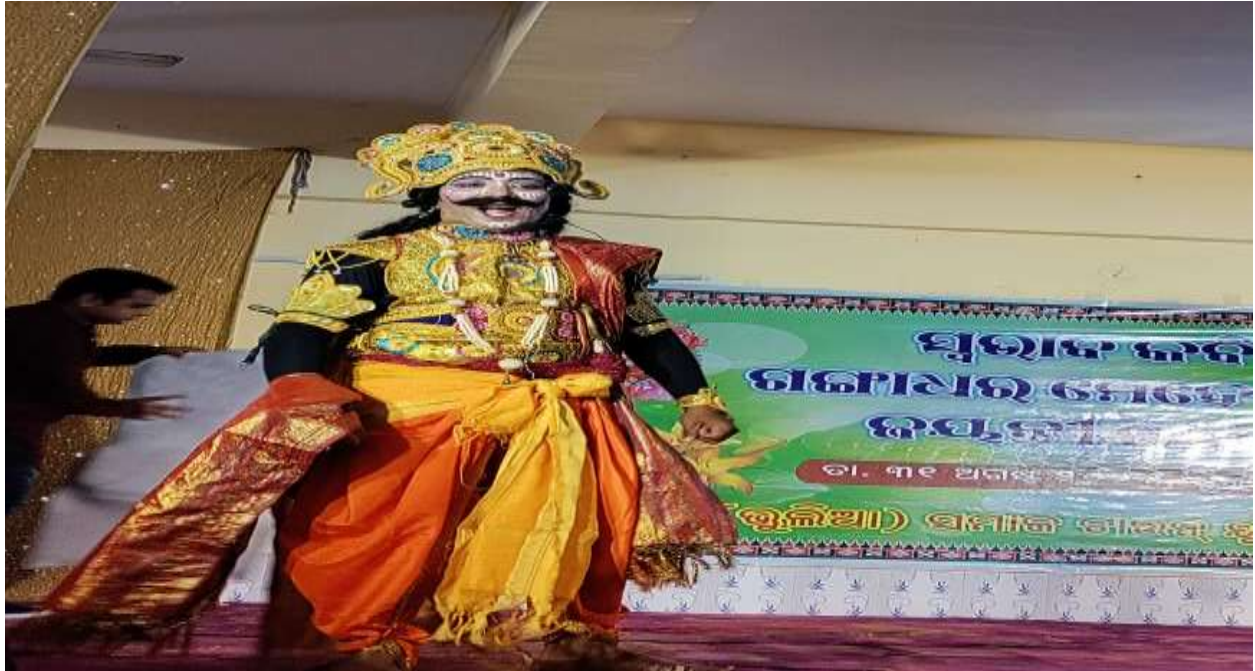
DRAMA PERFORMANCE BY STUDENTS