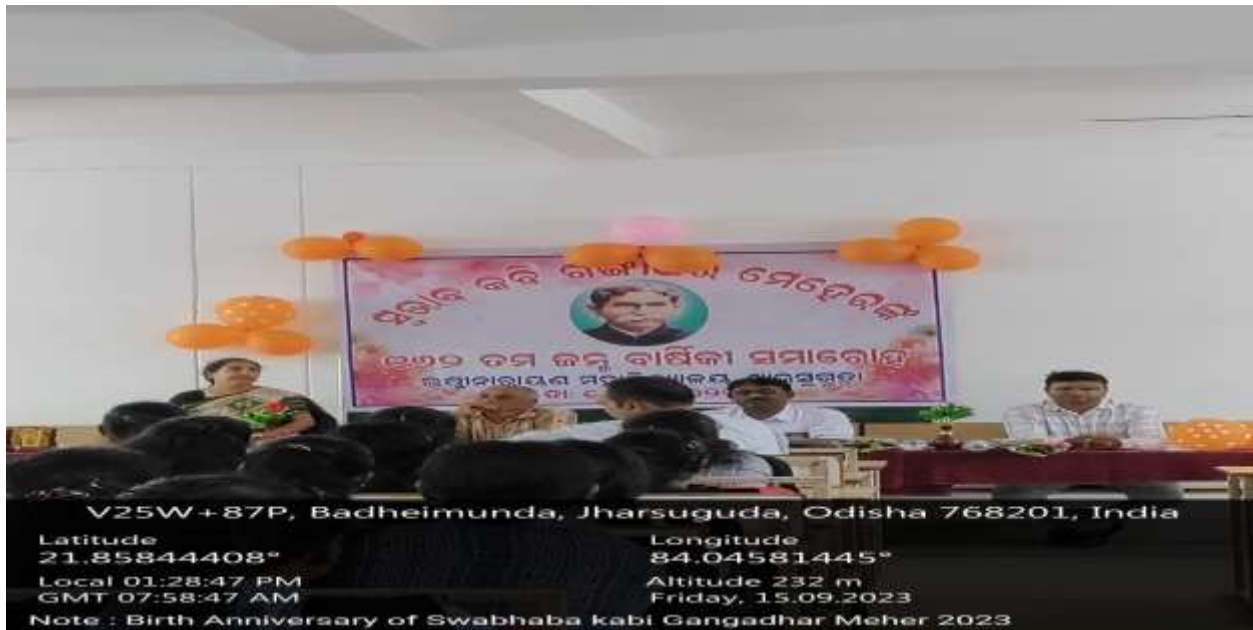
CELEBRATION OF KABI GANGADHAR MEHER BIRTH ANNIVERSARY