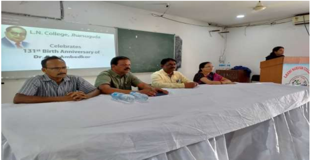
131 st BIRTH ANNIVERSARY OF DR. B.R. AMBEDKAR