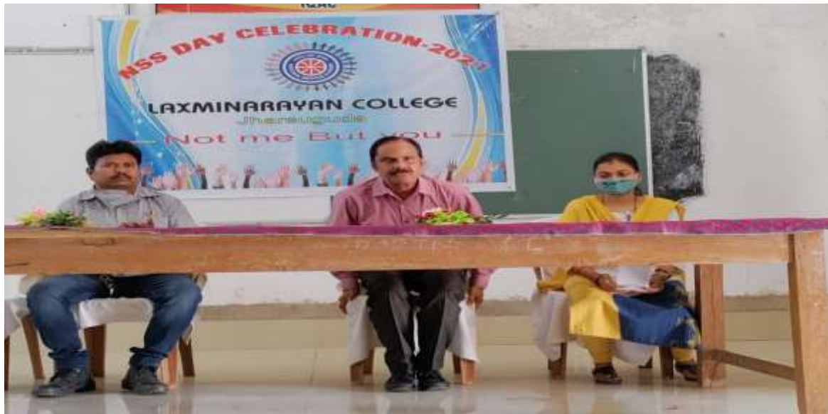
CELEBRATION OF NSS DAY