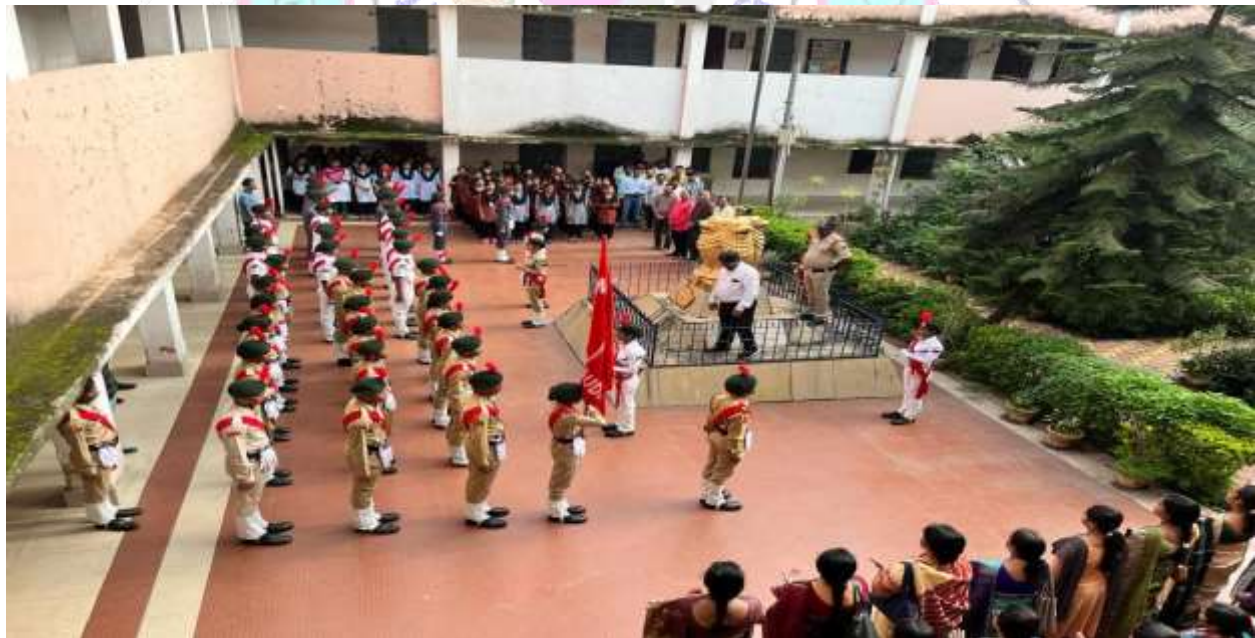
CELEBRATION OF INDEPENDENCE DAY