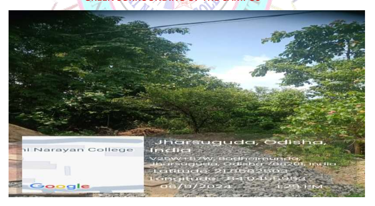
GREENERY IN THE CAMPUS