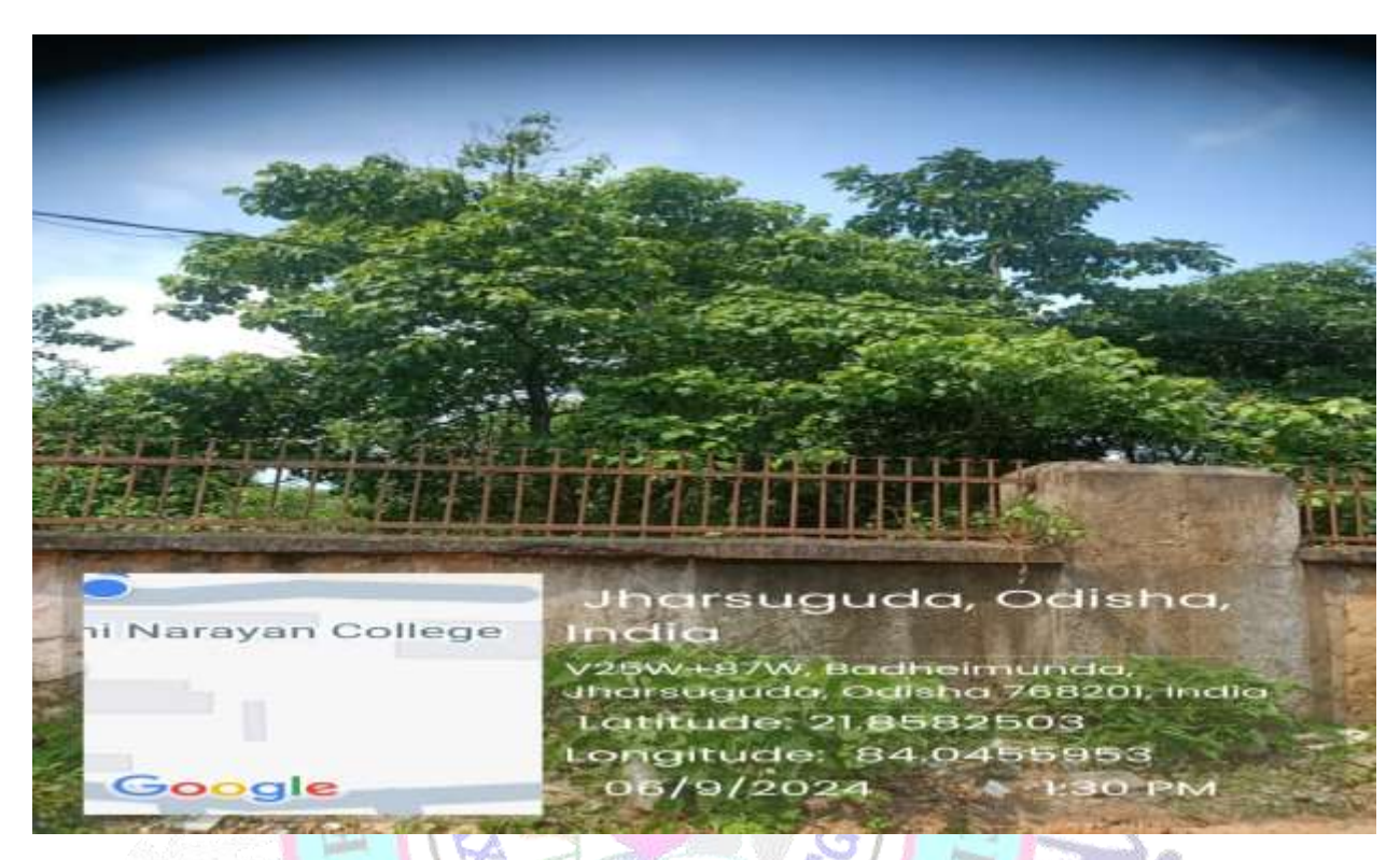
GREEN SURROUNDING OF THE CAMPUS