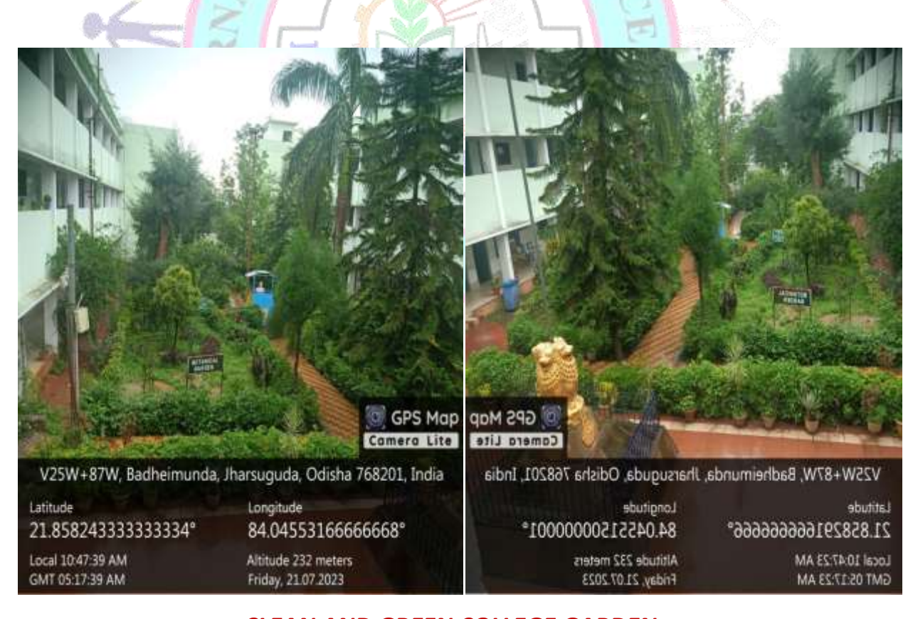
CLEAN AND GREEN COLLEGE GARDEN