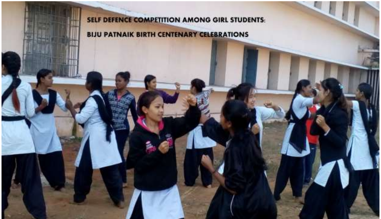
SELF DEFENCE COMPETITION AMONG GIRL STUDENTS: BIJU PATNAIK BIRTH CENTENARY CELEBRATIONS