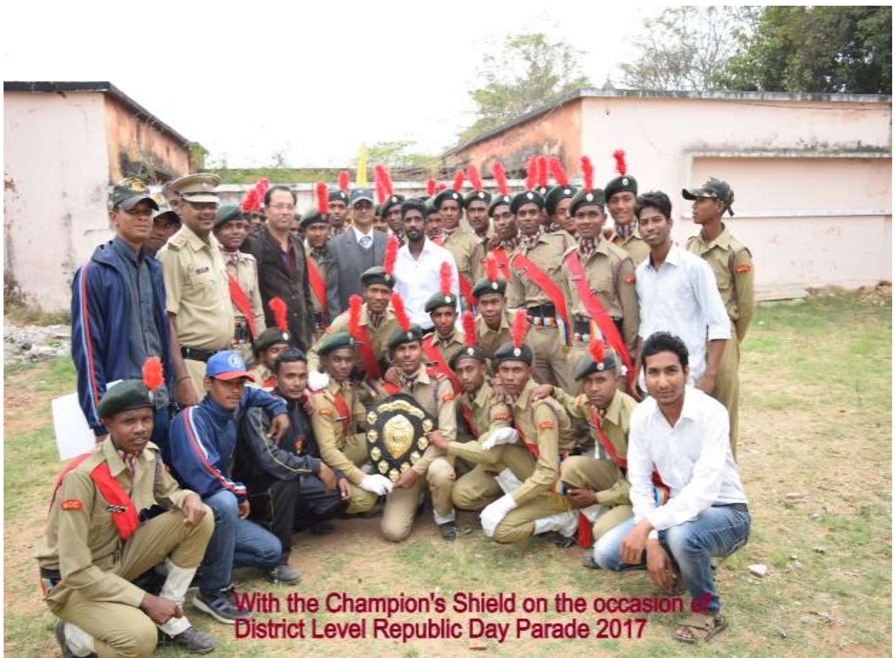
With the Champion's Shield on the occasion of District Level Republic Day Parade 2017