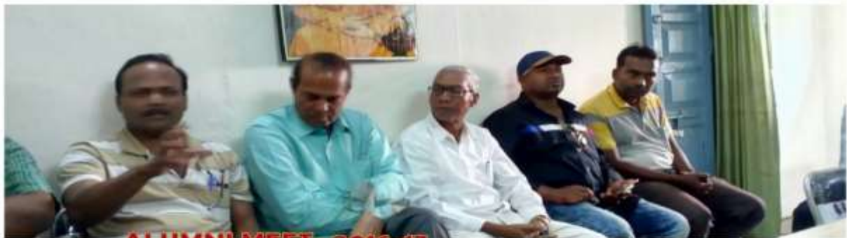
ALUMNI MEET - 2016-17 L. N. COLLEGE, JHARSUGUDA