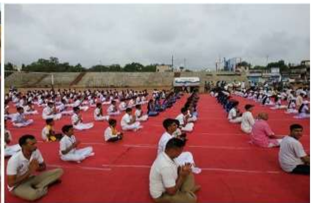
Students and Teachers of L. N. College, Jharsuguda Participated at International Yoga Day at M. E. School Ground on 21st June 2017