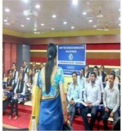
SHORT TERM COURSE ON COMMUNICATION SKILLS IN ENGLISH LANGUAGE 2016-17