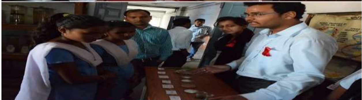
SCIENCE EXHIBITION (BIJU BIRTH CENTENARY CELEBRATIONS) Dt. 01/12/2016