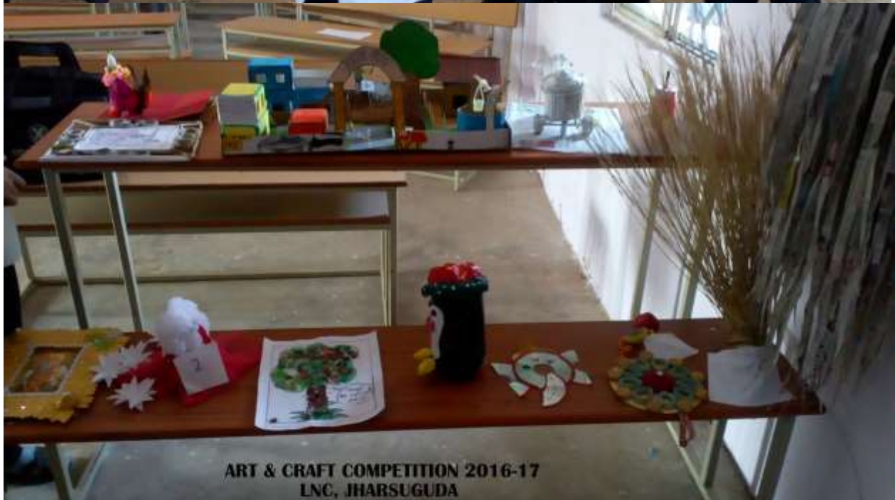
ART & CRAFT COMPETITION 2016-17 LNC, JHARSUGUDA