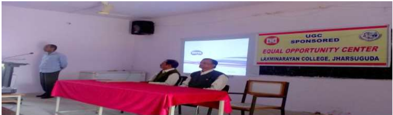
SEMINAR ON "RIGHT TO INFORMATION ACT" ON DT. 06/12/2016 L. N. COLLEGE, JHARSUGUDA