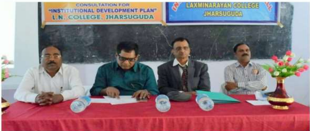
WORKSHOP ON 12TH MARCH 2017 FOR CONSULTATION WITH THE GB, ALUMNI, PARENTS, LOCAL ELITE AND STAFF FOR IDP FOR WORLD BANK ASSISTED PROJECT