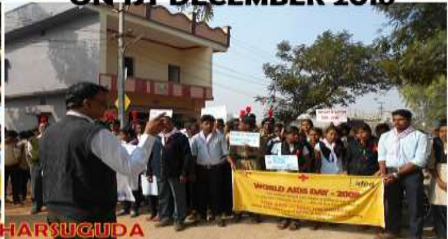
L. N. COLLEGE, JHARSUGUDA